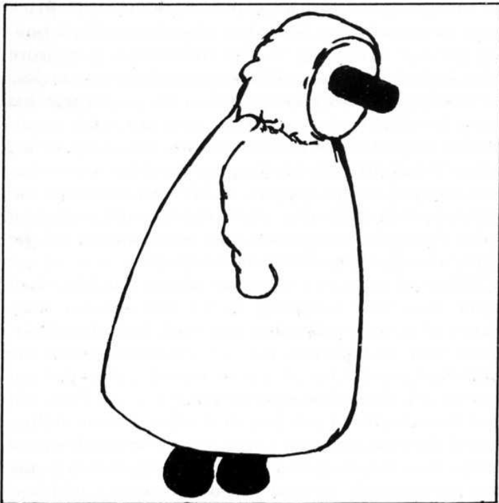
Figure 2: Stendek illustration of one of the entities.